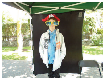
Youth-led photo booth encouraged youth connection to a community event.

Thanks to those who participated in the Connectedness Working Groups - top left Family Domain, top right Peer Domain, bottom left Community Domain and bottom right School Domain. Well done!!!