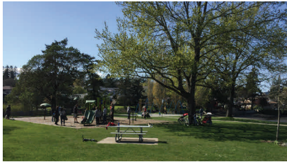
Earth Day at the Gorge encouraged youth connectedness to family.