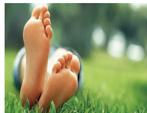
Reynolds School - Mental Health Day/Fair